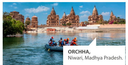
ORCHHA , Niwari, Madhya Pradesh.