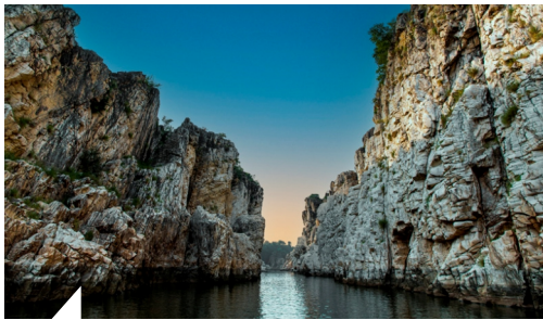
BHEDAGHAT , Jabalpur, Madhya Pradesh.