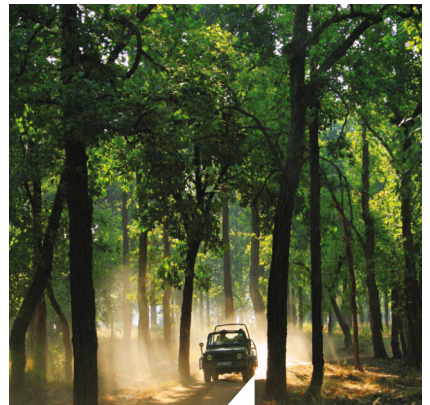
BANDHAVGARH National Park Madhya Pradesh.