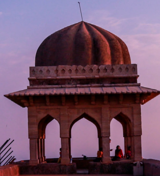
MANDU, Dhar, Madhya Pradesh

The state facilitates your film-making journey with a dedicated ecosystem to flourish the overall cinematic process, turning your cinema into a magnificent work of art.