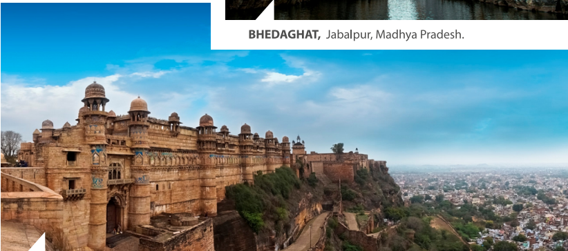
THE FORT OF GWALIOR , Gwalior, Madhya Pradesh.