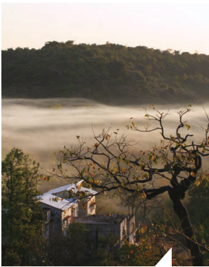
PACHMARHI , Narmadapuram Madhya Pradesh.